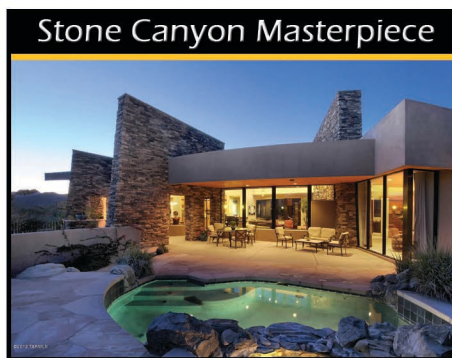
Stone Canyon Masterpiece

Listed Price - $1,395,000 Home Size - 4,526 Sq. Ft. Lot Size - 3.31 Acres 3 Bedrooms/4 Bathrooms Provided Courtesy: Russ Lyon Sotheby's