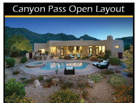
Canyon Pass Open Layout

Listed Price - $1,495,000 Home Size - 4,286 Sq. Ft. Lot Size - 1.00 Acres 4 Bedrooms/5 Bathrooms