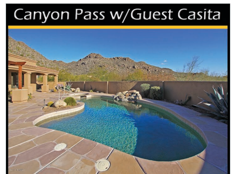
Canyon Pass w/Guest Casita

Prices Starting at $227,990 Home Sizes - 1,573 - 2,514 Sq. Ft. Choose From 8 Floor Plans Nearby Golf - 55+ Community