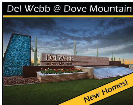
Del Webb @ Dove Mountain

Listed Price - $250,000 Lot Size - 1.00 Acres Excellent Oro Valley Location NO HOA & Mountain Views TeamWoodall.com/CanadaLot