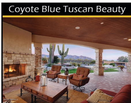
Coyote Blue Tuscan Beauty

Listed Price - $1,395,000 Home Size - 4,526 Sq. Ft. Lot Size - 3.31 Acres 3 Bedrooms/4 Bathrooms