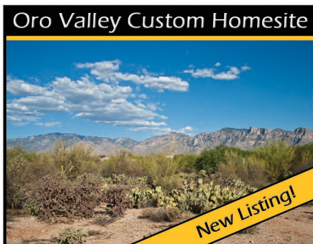
Oro Valley Custom Homesite

Listed Price - $1,149,500 Home Size - 3,675 Sq. Ft. Lot Size - 1.37 Acres 4 Bedrooms/4 Bathrooms Provided Courtesy: Long Realty