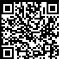
MOBILE APP QR CODE